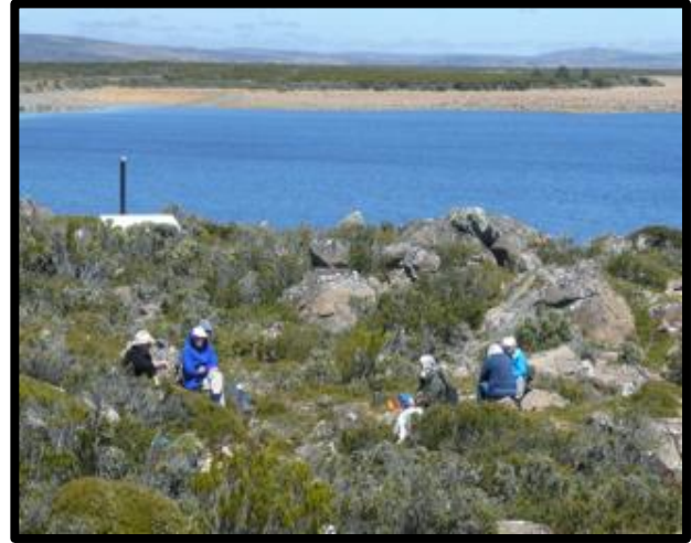
Pine Lake (above) and Lake Augusta (right)