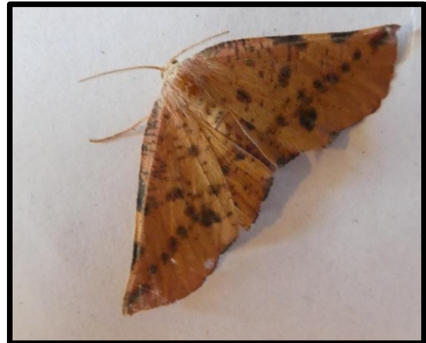
Wingless grasshopper (left) and unidentified moth (right)