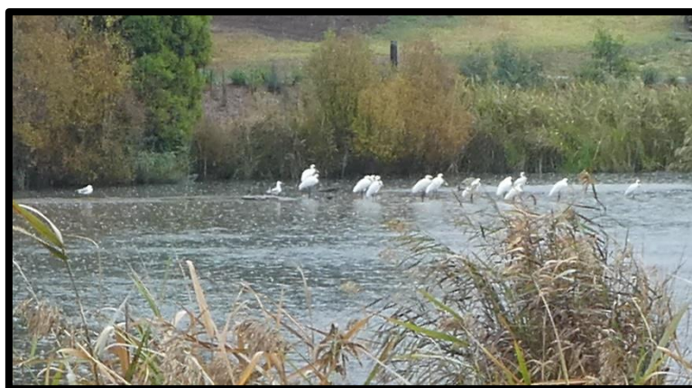
Spoonbills on the lake

The weather was not at all enticing for an afternoon walk in wind and rain, but 6 of us turned up. We knew there were 3 nests on the north side of the willow island with 1, 3 and 2 young in them. (A 4 th nest on the south side of the island had recently failed as the very young spoonbill in it had disappeared). It was soon obvious that most of the adult spoonbills had come off the island and were assembled, out of the wind, near the Rivulet's exit into the lake, together with 4 of their juveniles. It was the first time the juveniles had been seen off the island. The youngsters were easy to identify because – unlike all the other spoonbills – they are still snowy white.