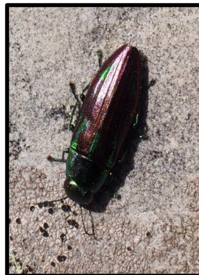
Melobasis purpurascens , jewel beetle