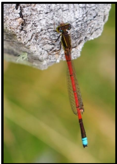
Ischnura aurora , aurora bluetail